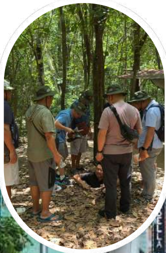
Cu Chi tunnels