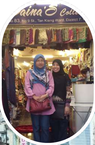
Daiana collection shop